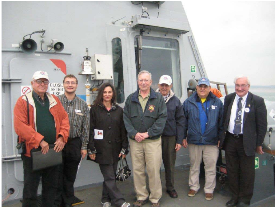
Onboard HMS Duncan, RN's Newest Destroyer