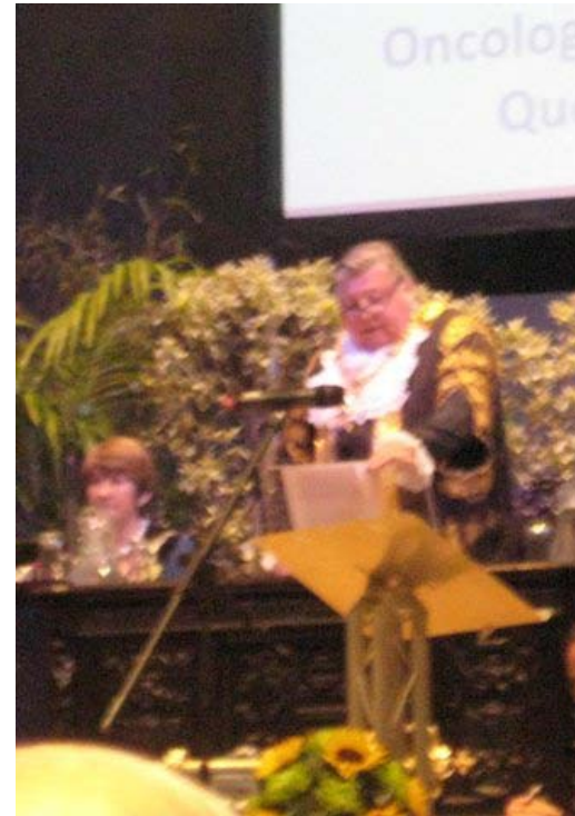
Presiding Over the LMM Ceremony