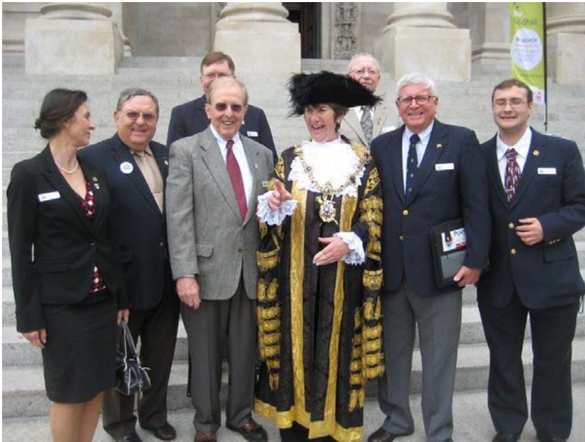
On the Steps of the Guildhall