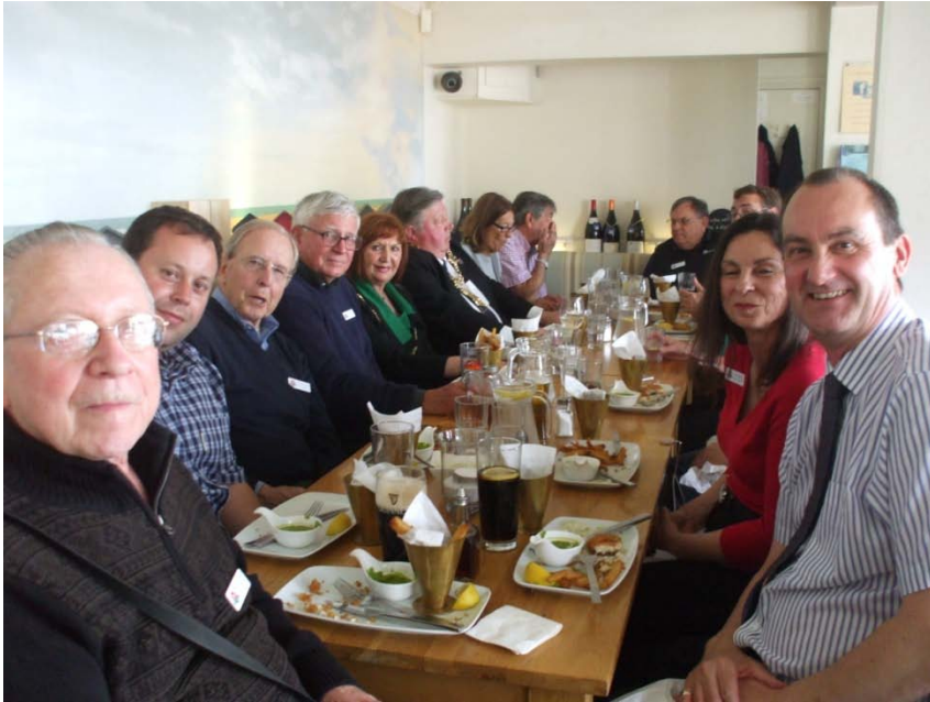
Lunch on Waterfront Hosted by Lord Mayor