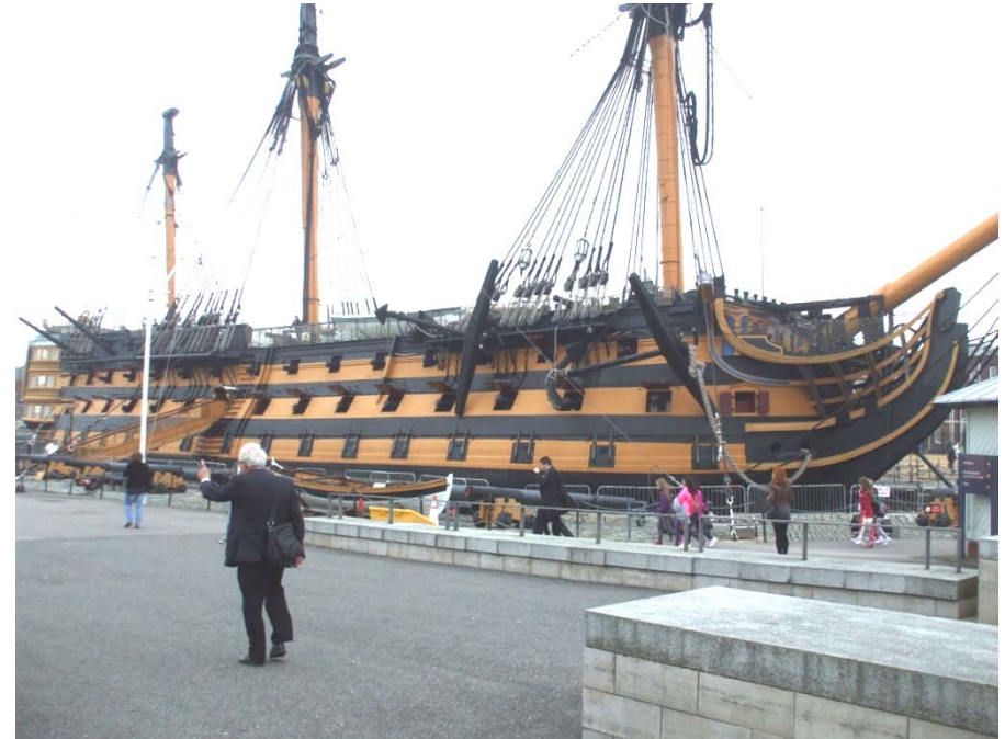
HMS Victory, Lord Nelson's 1805 Flagship, in drydock