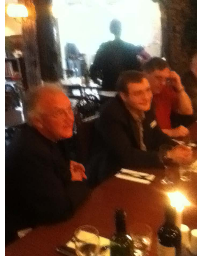
Lunch with the Reverend at the Dolphin, one of Portsmouth's oldest pubs