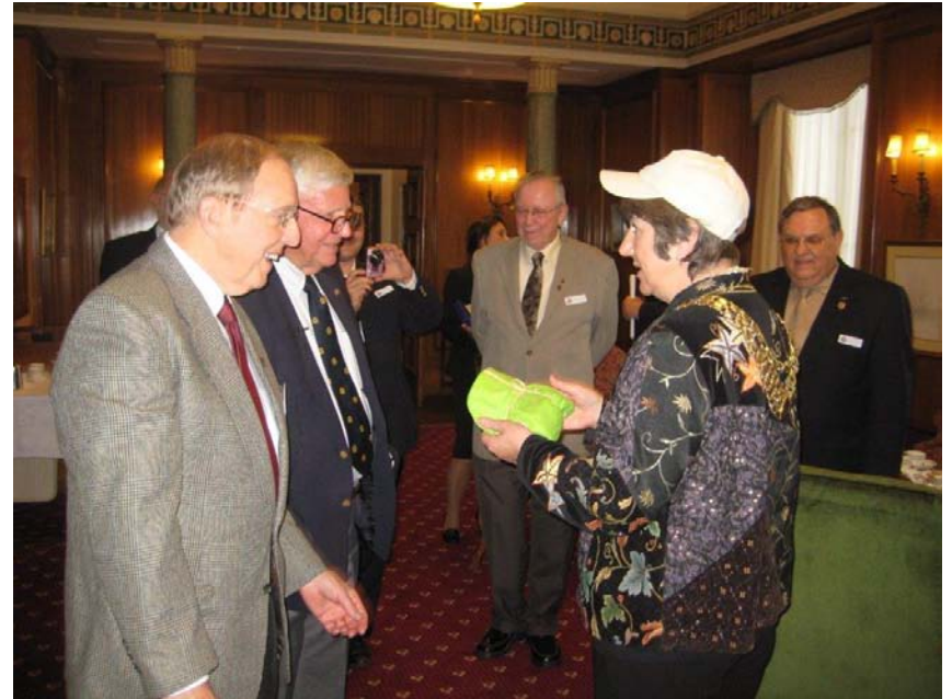
The Lord Mayor's New 375 th Cap