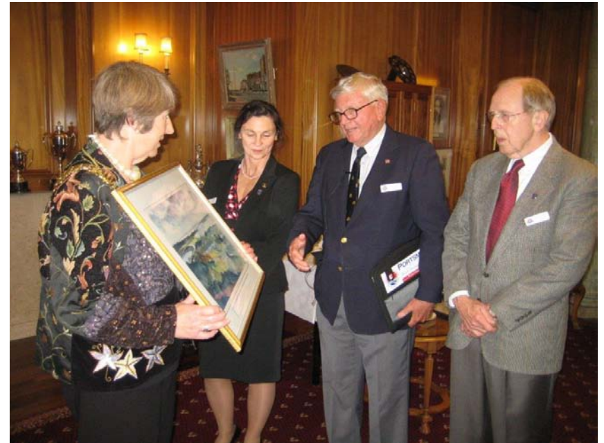
Giving our Present to the New Lord Mayor