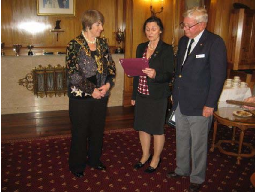
Presenting our Invitation to the Lord Mayor